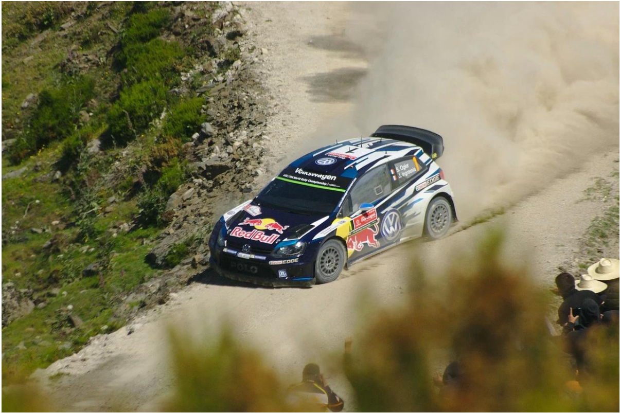
Note: picture from pixabay