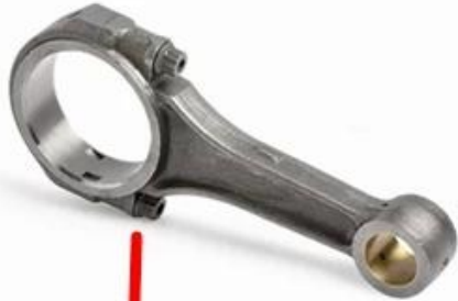
OEM connecting rods

provided to match your Volkswagen crankshaft, please browser all our air cooled Volkswagen engine parts categories to complete your VW engine rebuild project from OEM to High performance rods.