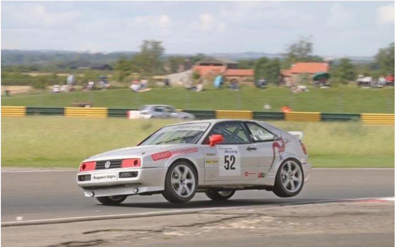
Note: Picture from All Racing Cars.