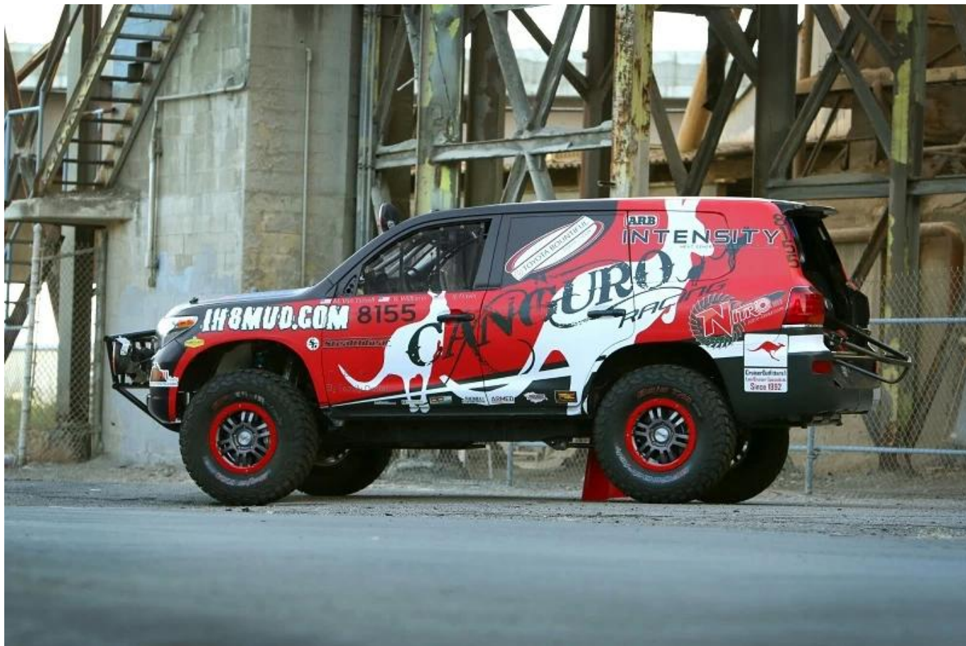
Note: Picture by Build Race Party