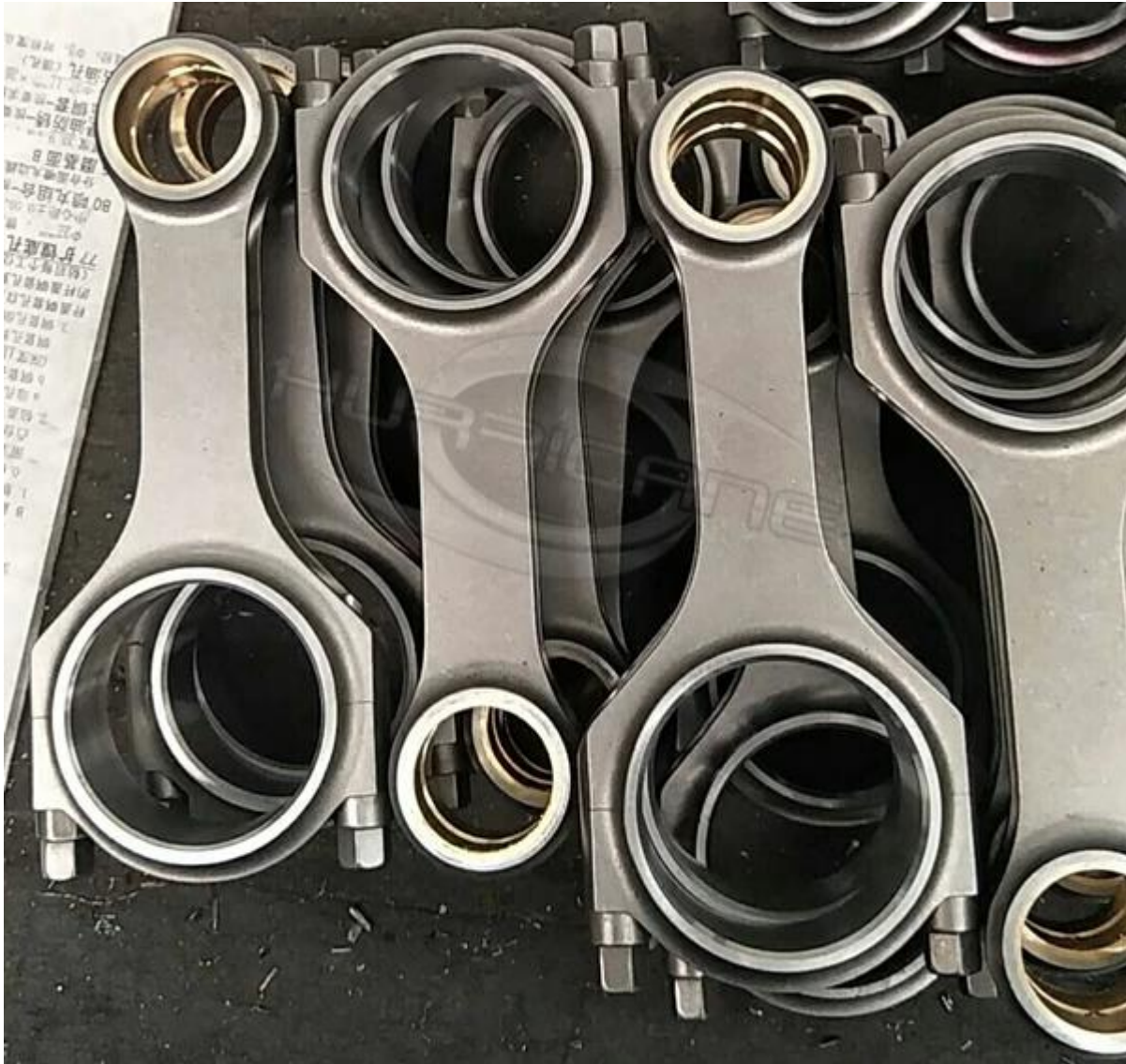
Hurricane Connecting Rods Factory Picture