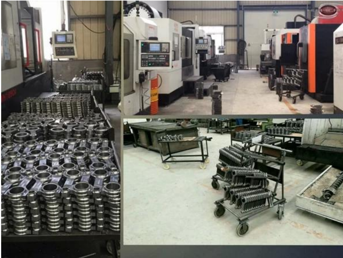
Toyota 4340 Forged X-beam Connecting Rods Picture