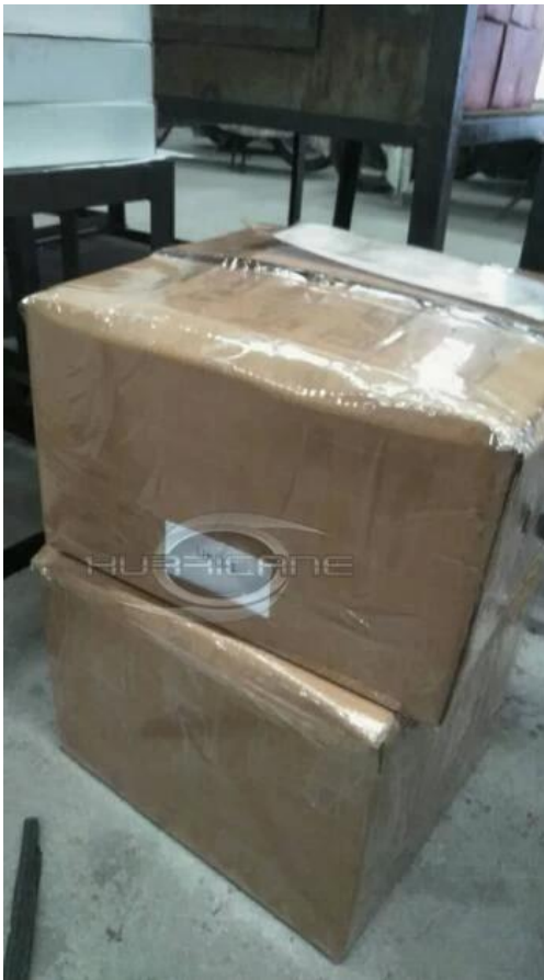
All the Pontiac 455 forged rods 100% finished by CNC machine ,fully shot peened and honed to meet high quality standard .