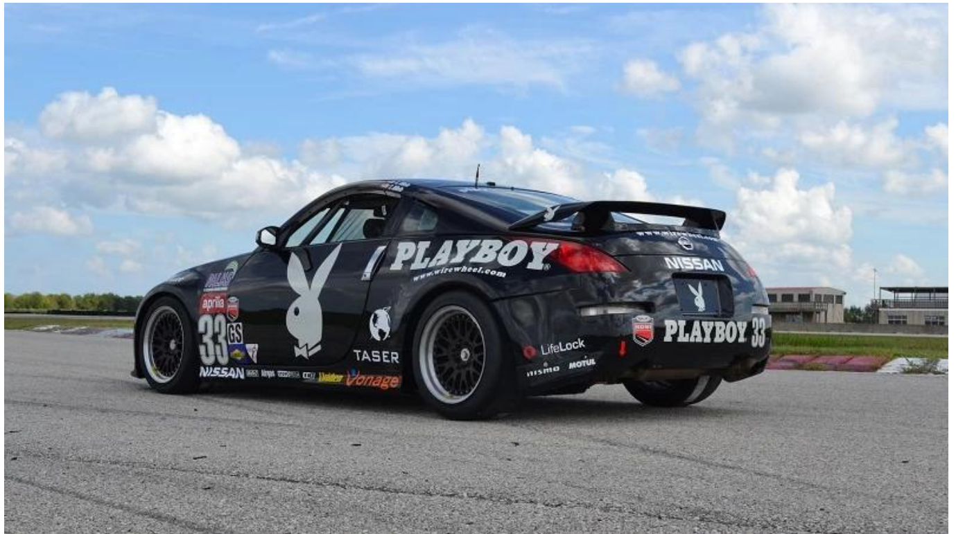
Note: Picture from Mecum Auction.