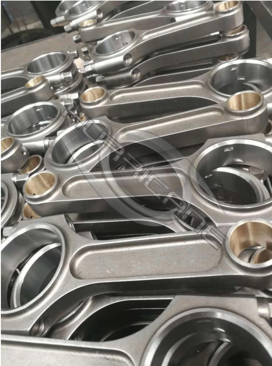
Shipping by Sea