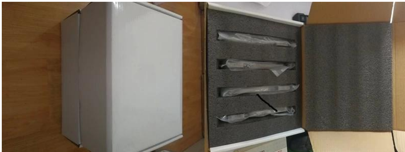
B: Neutral package