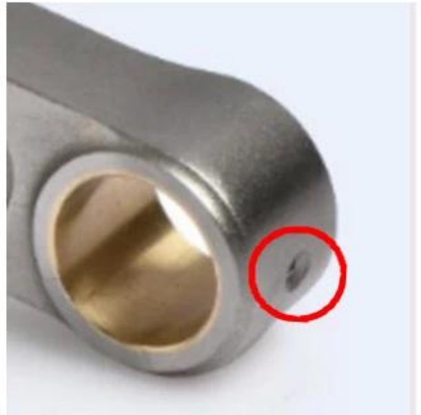
one oil reservoir: I-beam, X-beam