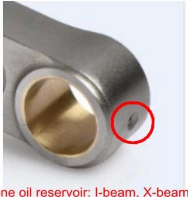
one oil reservoir: I-beam, X-beam