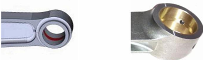
Radial Groove Sleeve

Silicon aluminum bronze rod sleeves with radial groove for oil tank and best pin oiling.