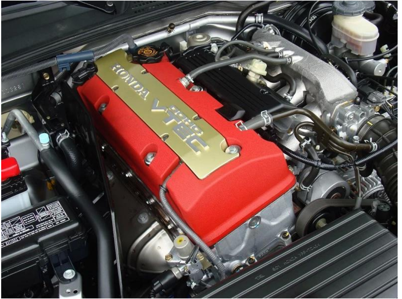
Note: picture from Wikipedia.