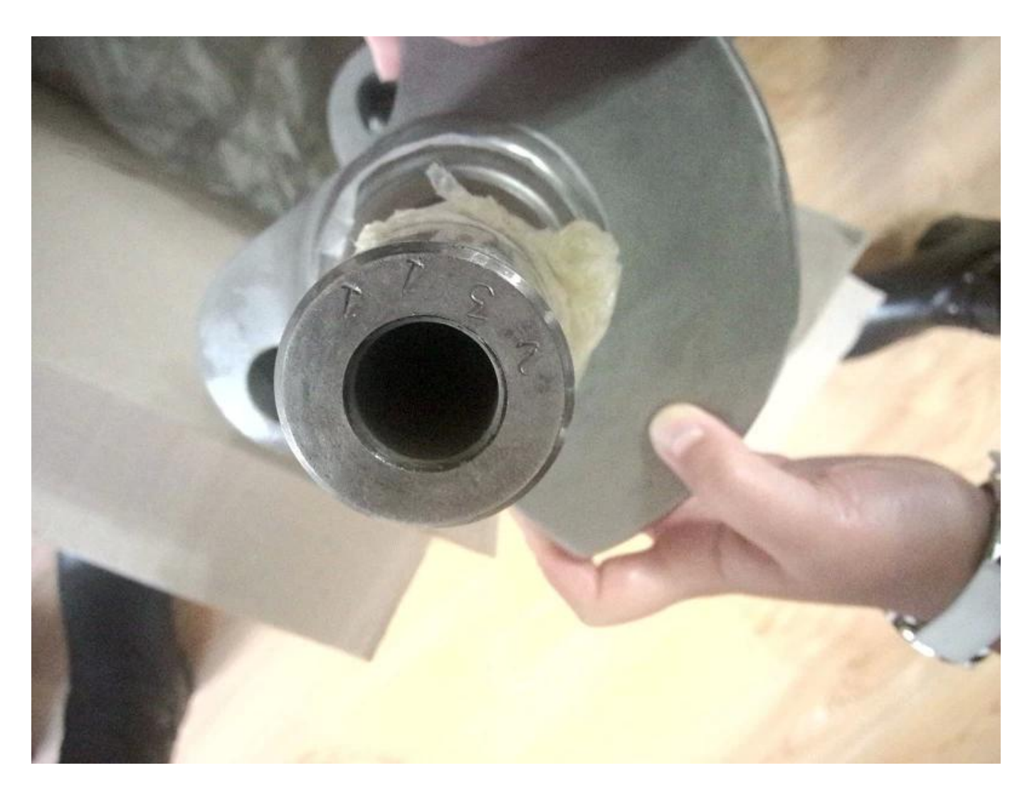
Hurricane finished LS1 Forged 4340 Steel Crankshaft 3.900" Stroke are also ground to EXACT sizes, magnafluxed, and dynamically balanced. much more every piece of our LS1 cranks have serial number (identify mark).