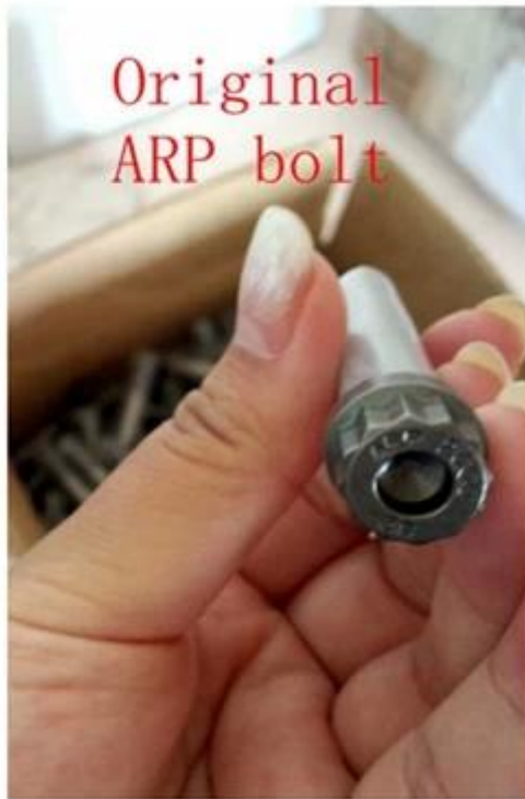
Hurricane bolts picture