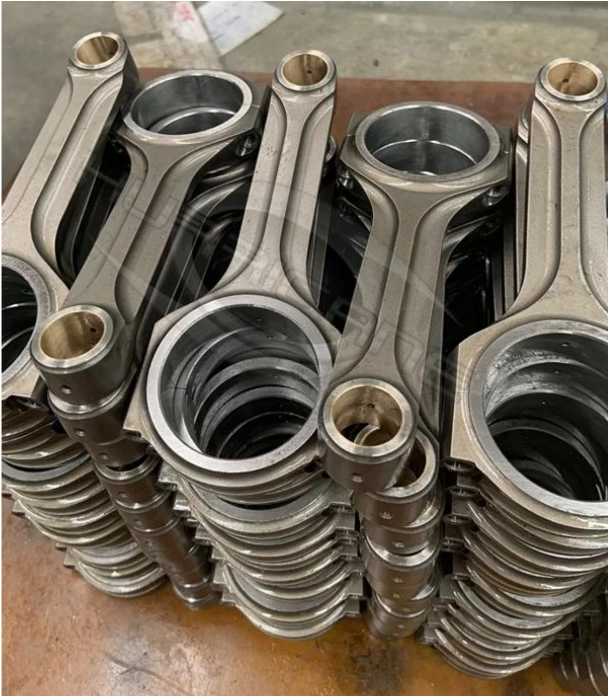
Hurricane X-beam Forged Connecting Rods Packing Pictures