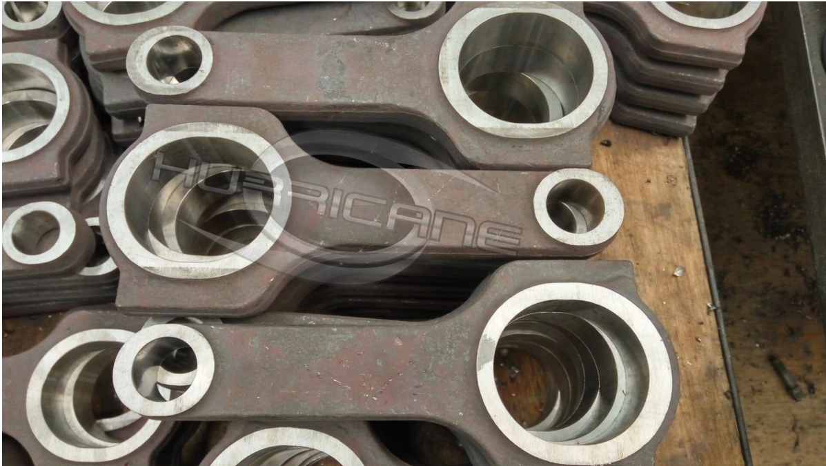
Shot peened connecting rods

High quality 4340 forgings picture: each forging is X-rayed , sonic tested and magnafluxed.