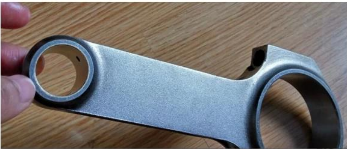
Connecting Rods, 5.400" Length, 3/8" ARP Bolts, H-Beam, VW Journal, Hurricane Speed&Performance race connecting rods, Sold as Set. MOQ: 80PCS for new customers.