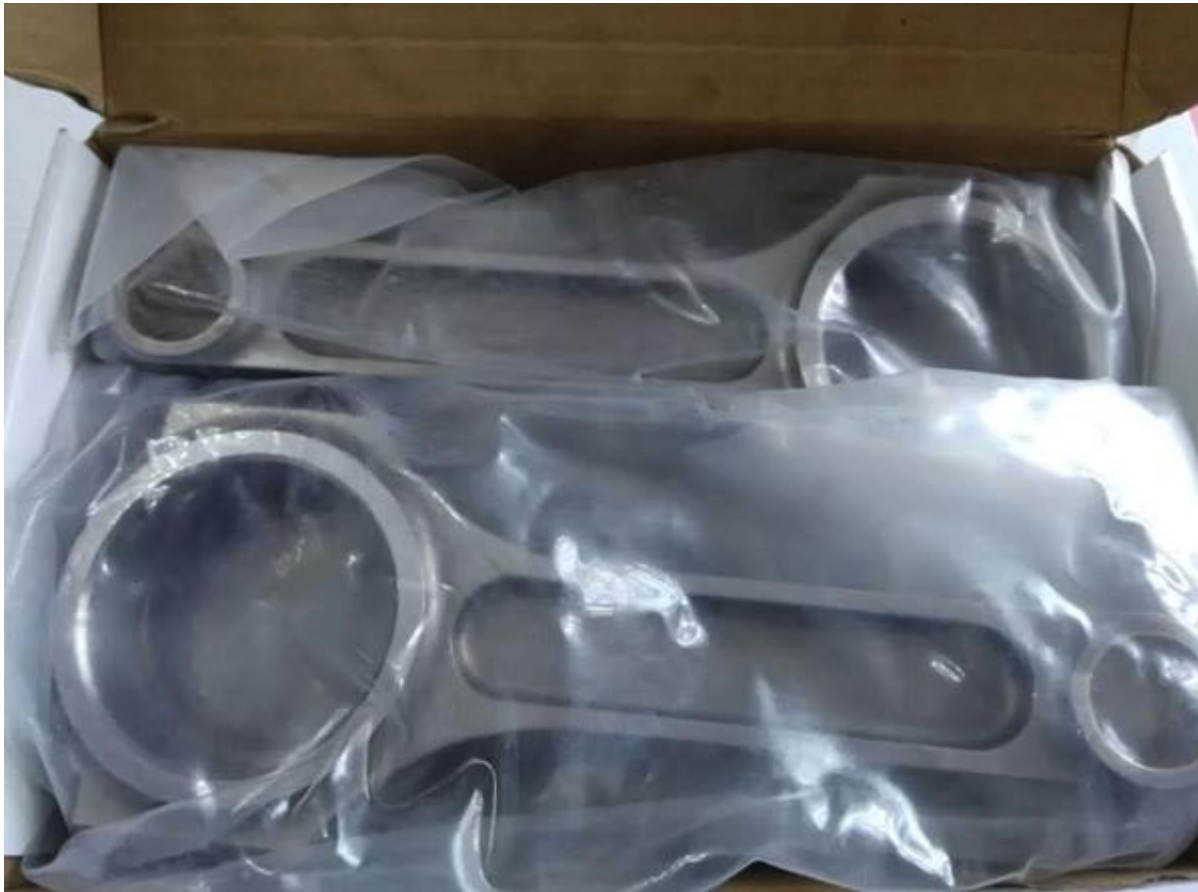
Connecting Rods Production Process