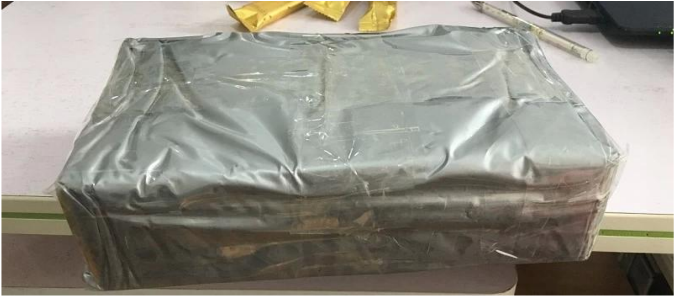
Batch order packing picture -by air express