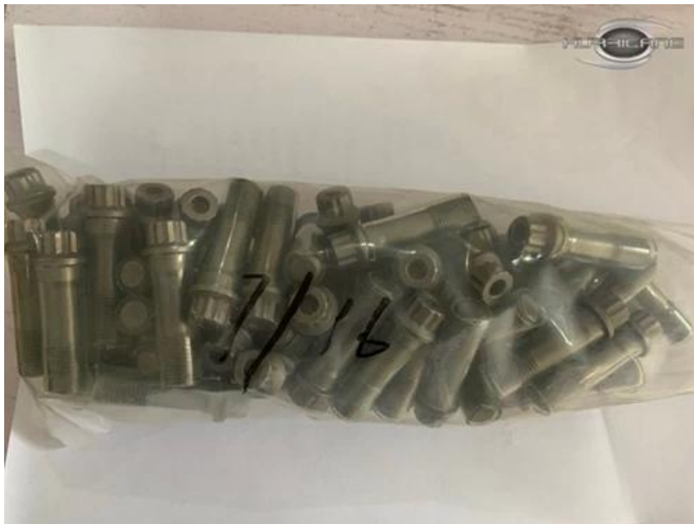
Hurricane 3/8" Connecting Rods Bolts