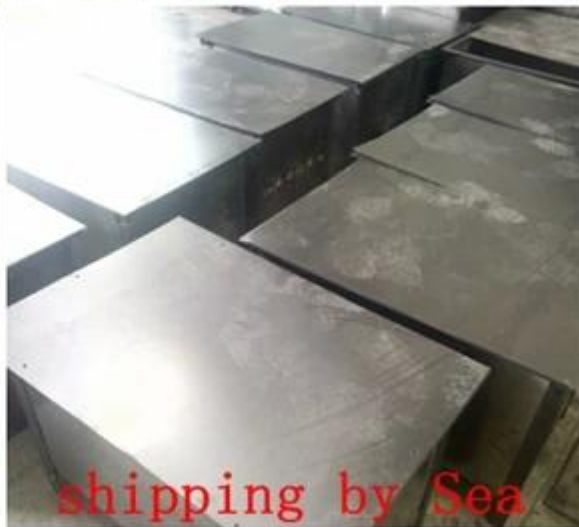
shipping by Sea