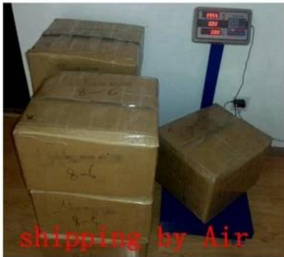
shipping by Air