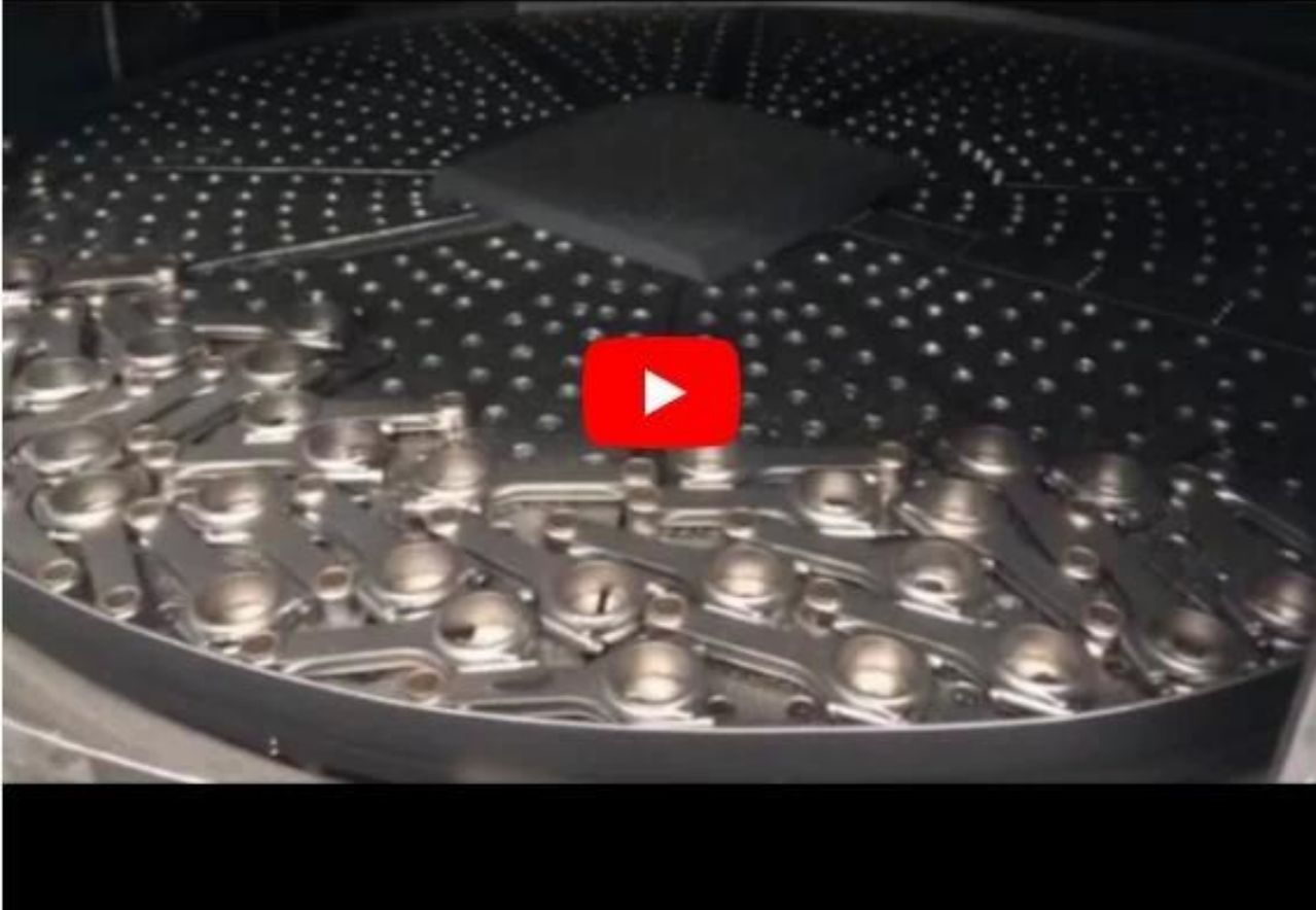
Hurricane factory workshop