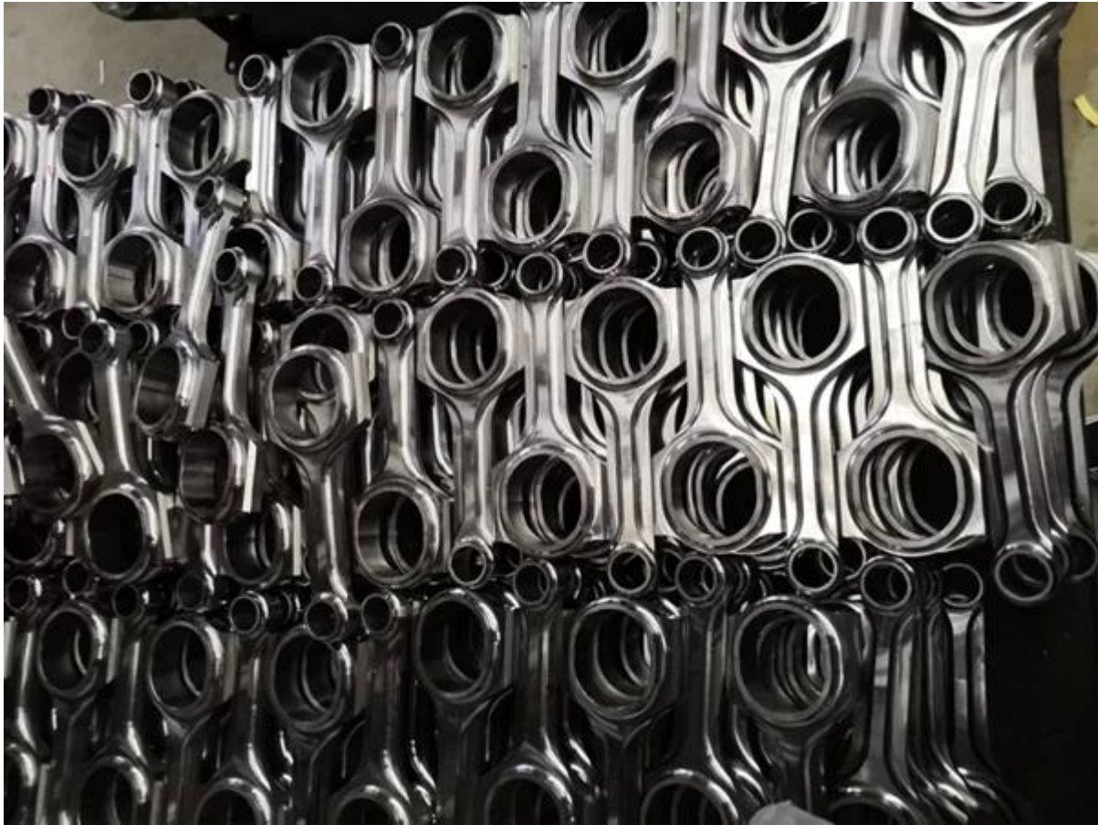
Finished X-beam connecting rods