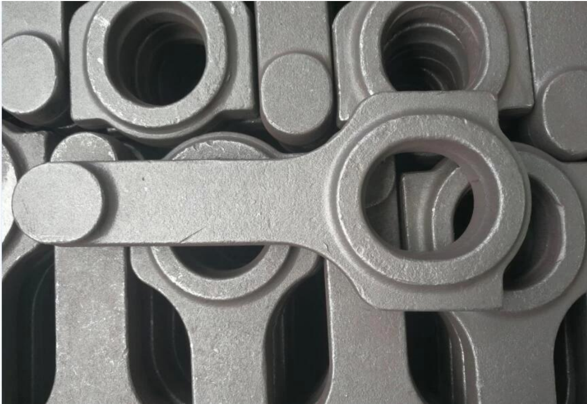
2. Honed bid end bore and small end bore with bushing