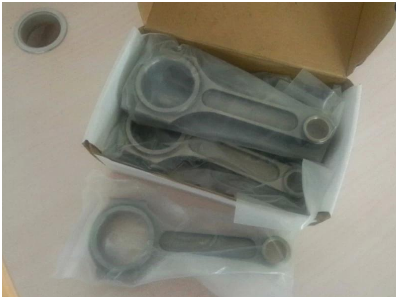
Nissan Skyline Car Picture