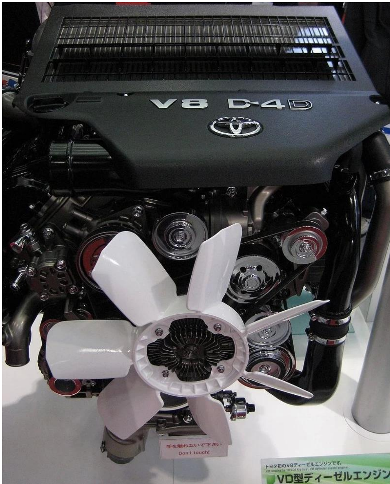
Note: Picture from wikipedia.