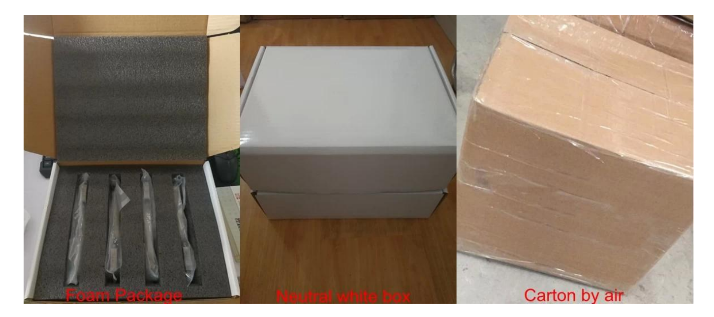
By Ocean, foam package, Neutral white box and iron box