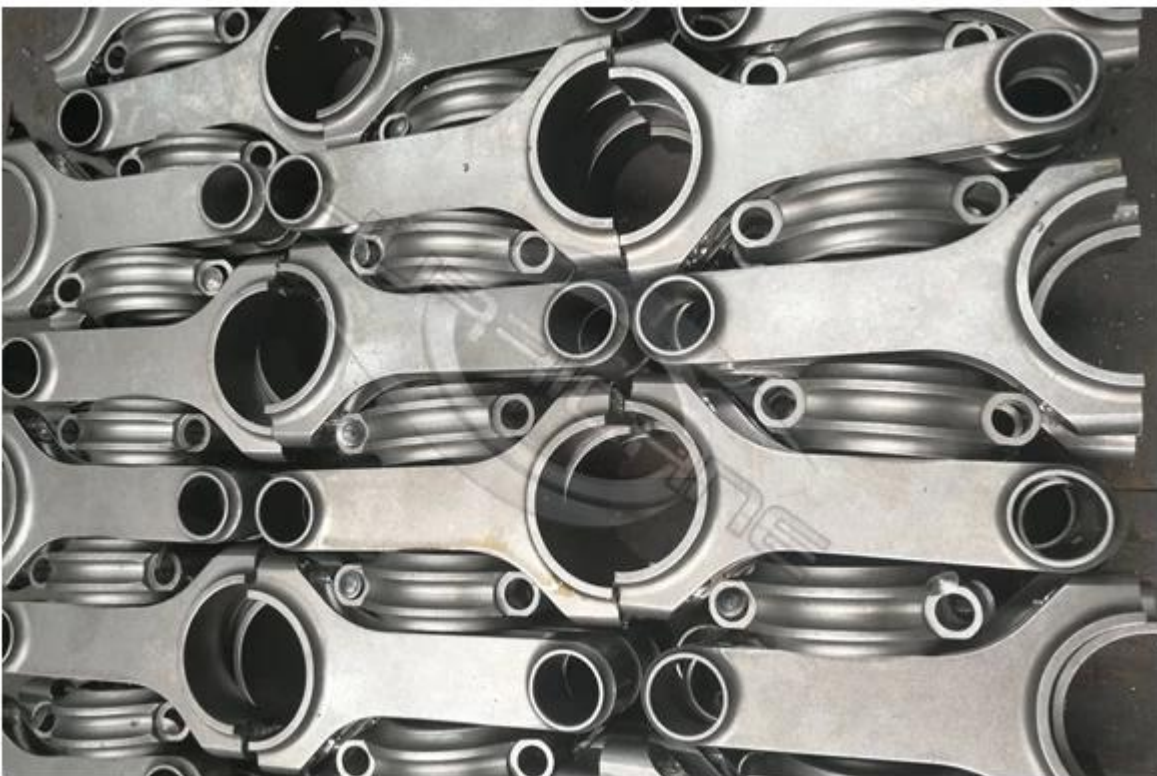
Hurricane Connecting Rods Manufacturing Process