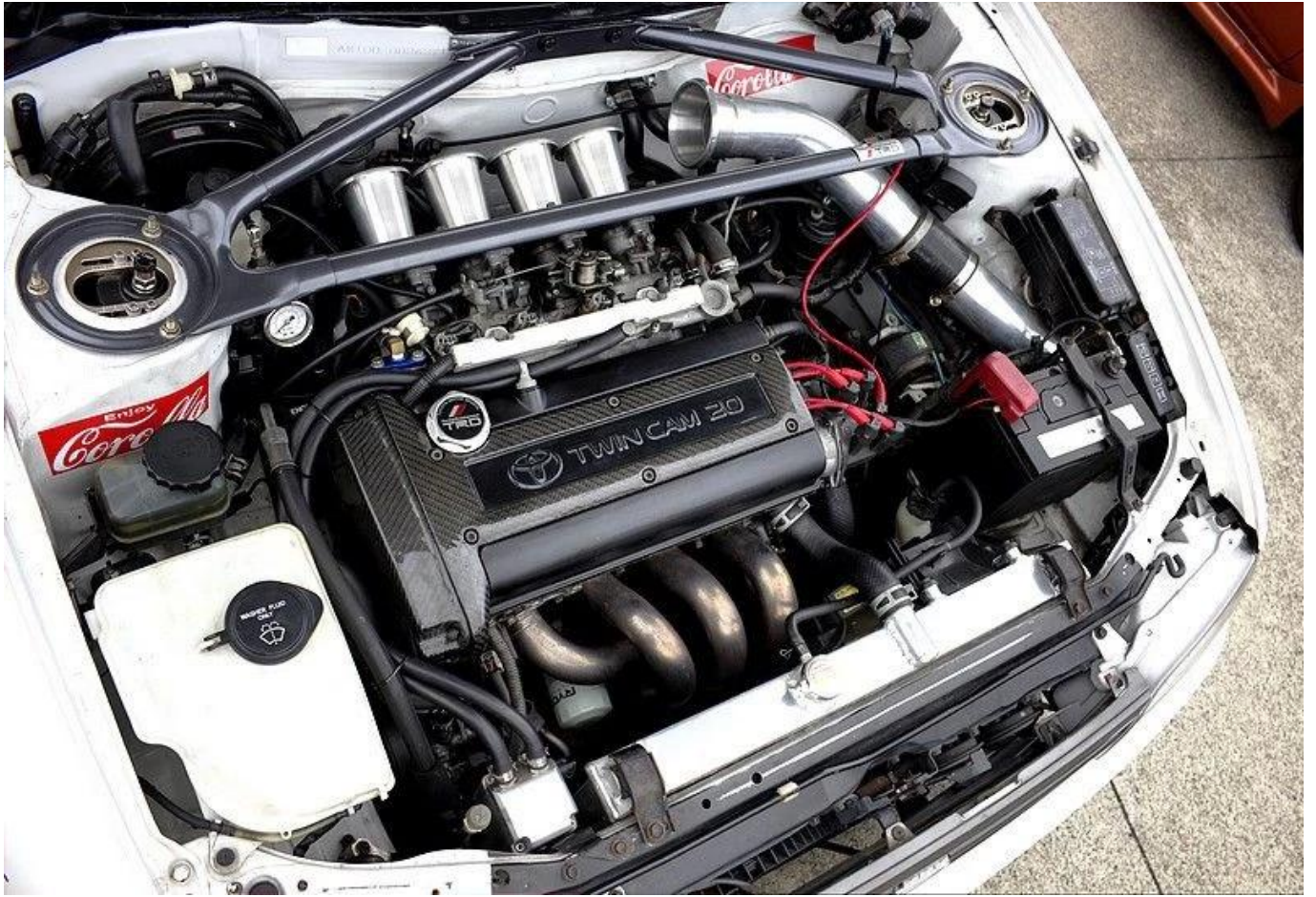
Note: Picture from Pinterest.