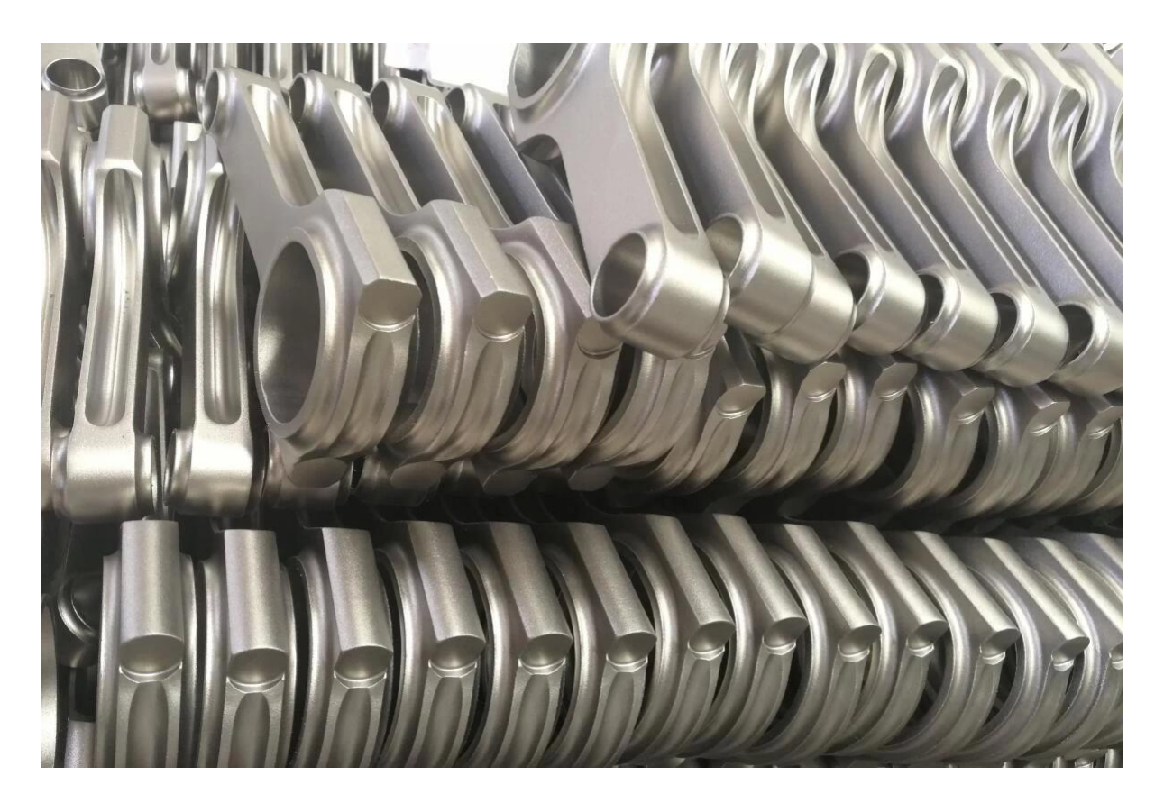
4. Hurricane Speed and Performance Retail package