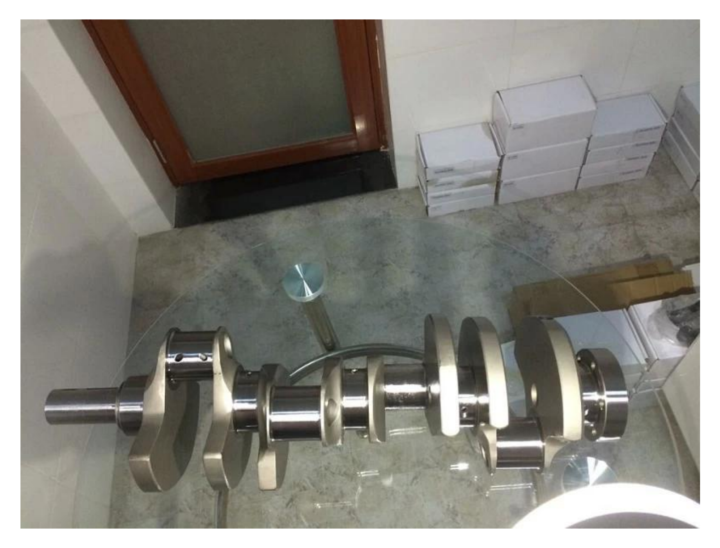
Hurricane Chevrolet GM Crankshafts Series Number