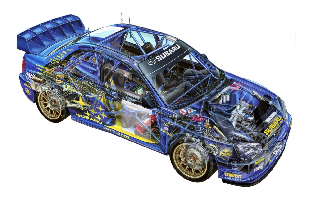
Note:Picture from Cutaway Cars | Alexander Fedotov