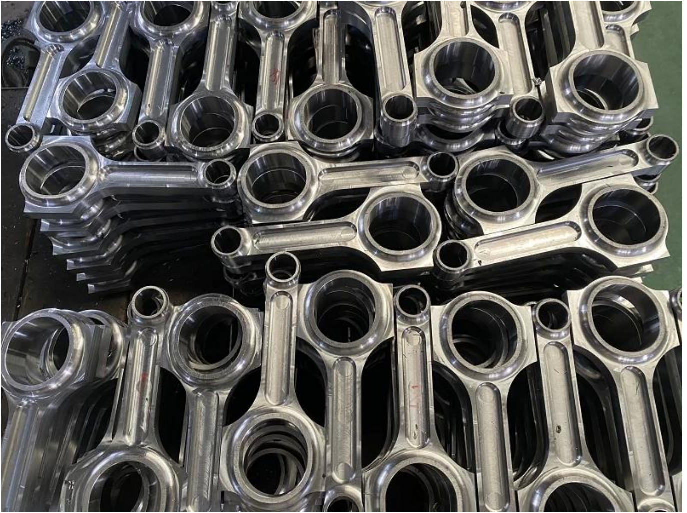
Note: GM Chevy V8 BBC forged 4340 steel connecting rods production picture.

At present, custom rods are among our best-seller list, there are three features which are most popular in 2018: