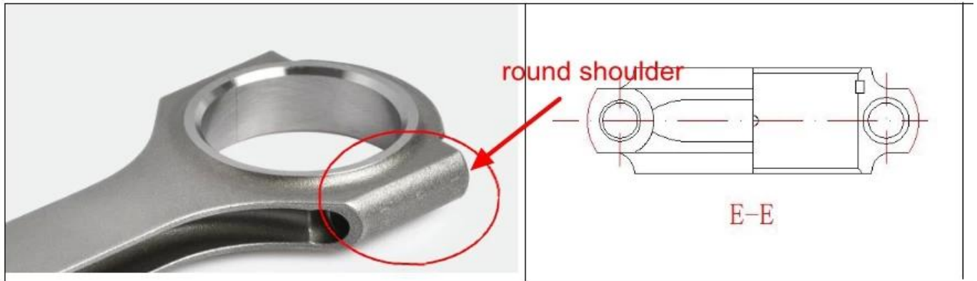
Chevrolet(gm) H-beam Connecting Rod Picture